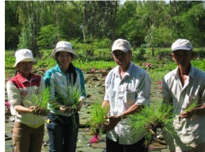
Presenting young rice seedlings in SRI