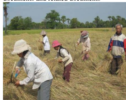
Harvesting activities of members

The elected leaders (chairman, vice chairman and cashier) from CFAs and CBOs receive a training on additional roles, responsibility, organizational management including estimate of small business, income and expense control, indication the