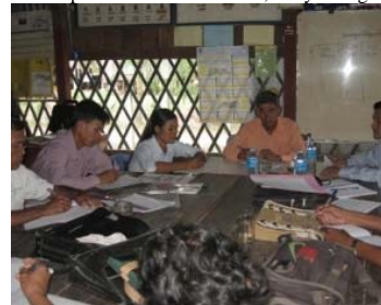
Workshop training with the Family Economic Development Association FEDA, Kampong Chamlang, Svay Rieng

These member organizations have also elected their leaders by democracy with regular mandate of office holding within the management committee. Up to now CamFAD has 818 different registered producer groups under these 16 members organizations which categorized into 1. savings, 2. animal rearing, 3. poulties rearing, 4. vegetable growing, 5. fish raising, 6. rice growing, 7. handicraft groups 8. rice bank, 9. cow bank 10. fertilizer credit and other involving business initiated by individual members.