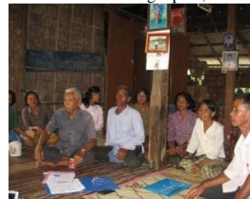
Workshop training with Agricultural Development Community (Sor.Or.Kor) Raksmei Samakee Association (RSA), Prey Veng

Finally, there are 16 members based organizations from 85 villages in four provinces have registered as membership of CamFAD these are: 1. Svay Rieng: Svay-Chrum, Portireach, Thlork, Svay-Tayean, Thnot, Kampong-Chamlang x2 , Chek, Basac, Koy-Trabek, Kruos, Svay-Ang of three districts (Svay- Chrum, Svay Rieng and Kampong Ro) 2. Prey Veng: Speukor and Rongdomrey of one district (Baphnom) 3. Kampong Speu: Kanduoldom of one district (Chbarmorn) and 4.