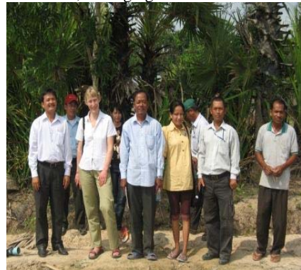
Picture during advisory mission of Agriterro to CamFAD