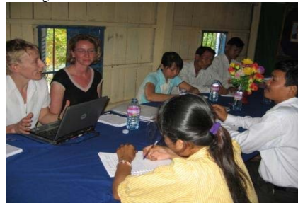
Advisory mission of Agriterra to CamFAD