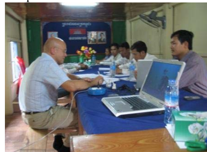
Consultant from Agriterra meeting with CamFAD staff after a strategic plan, Nov

Finally, there are 16 members based organizations from 85 villages in four provinces have registered as membership of CamFAD these are: 1. Svay Rieng: Svay-Chrum, Portireach, Thlork, Svay-Tayean, Thnot, Kampong-Chamlang x2 , Chek, Basac, Koy-Trabek, Kruos, Svay-Ang of three districts (Svay- Chrum, Svay Rieng and Kampong Ro) 2. Prey Veng: Speukor and Rongdomrey of one district (Baphnom) 3. Kampong Speu: Kanduoldom of one district (Chbarmorn) and 4.