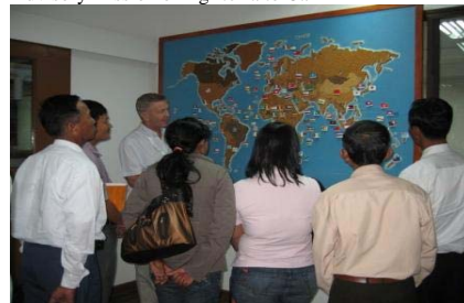
Participants visited IRI in Philippine