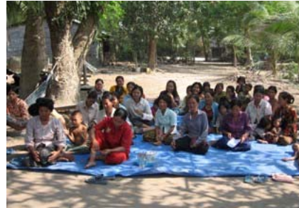
Training sessions on savings principles and,

The exposure visit is one of the most effective ways of CamFAD under support from Agriterra and farmers to farmers cooperation in the region, farmers got new ideas and realized much on associative functioning, added value of FO and knowledge received from all visited areas to consider when they came back to Cambodia. BoD have their regular meetings which they can discuss their problems, exchanged experiences, improved their roles and responsibility as a leader. Two staff have gained knowledge directly from