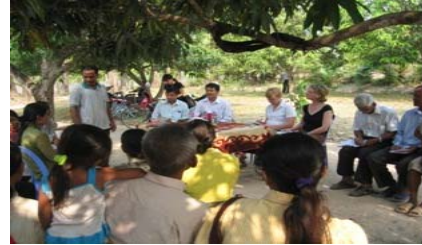
Agriterra officers met members at the villages