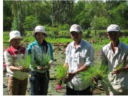
Presenting young rice seedlings in SRI