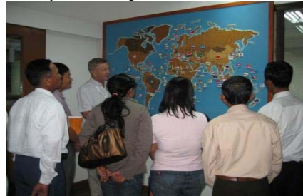
Participants visited IRI in Philippine