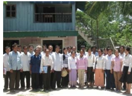
Group pictures of BoD members, their management committee and staff during their monthly workshop training at the central office of CamFAD federation

including an estimate of small business involved, income and expense principles etc for CFAs leaders every month i.e. from April up to last December 2008 under operational cost support from Agriterra, the Netherlands to strengthen their associative functioning, added value of FO and,