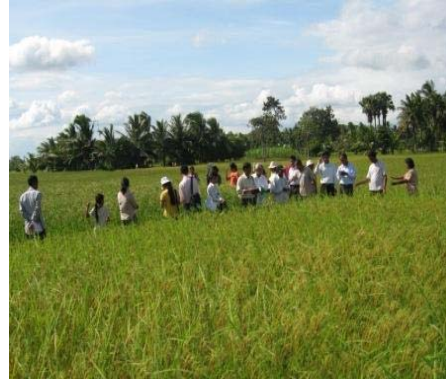
Visiting the dry rice production of rice members in Kampong Chamlang commune, CFA

CamFAD is seeking markets in the country and outside to sell farm products if they produced more a need with proper price.