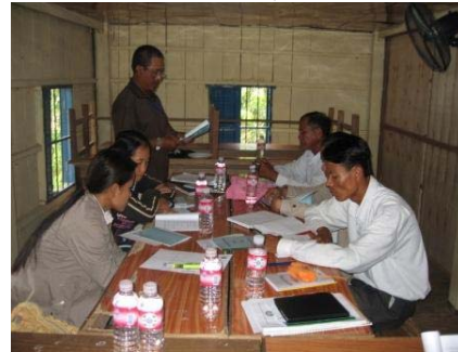
Discussion on technical training documents and related documents