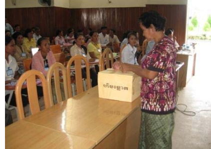
Election of two interim vice chairpersons during the annual general meeting of CamFAD 30 th December, 2008