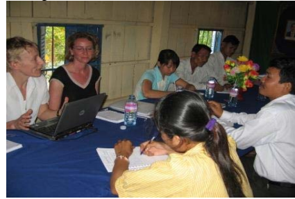
Advisory mission of Agriterra to CamFAD