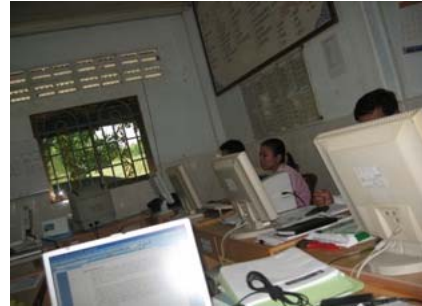
Working activities at the central office

responsibilities as farmers' leaders and BoD of the federation. Technical training documents on pig rearing, chicken rearing, vegetable and crops planting, rice planting (SRI), fish raising, cow rearing and policy involved have been developed and established to indicate clearly the methodology of how to follow the rules and guarantee the long run of development of member organizations with high responsibility in the future. CamFAD has conducted its activities through the project titled CamFAD Rural Poverty Reduction and Market Access (CROP-MA) supported by Agriterra, The Netherlands. Office of CamFAD is supplied properly with fan, fax, phone, e-mail, internet and eight computers to run the activities, 1 fax/phone, 2 printers i.e. HP DeskJet and Laser, 10 desks for computers, 2 cupboards, 1 digital camera, the internet and e-mail is available at CamFAD office since last year 2007, in 2008 CamFAD has also changed a past hosting web company to present one due to technical problems and development of its website design to show on time progressive activities within the federation at www.camfad.org properly, its members' activities will also be presented in the webpage in 2009, 4 motorcycles are still in use for transportation to conduct the project implementation at the fields directly with members.