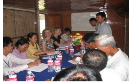
Advisory mission of Agriterra officers to CamFAD

BoD members have regular workshop training every month to strengthen and improve their knowledge toward the self responsibility for their own communities in the future. The initiatives of increasing of their income from agriculture not only producing for household consumption but also producing for market demand in the future. Farmers will understand the importance of getting income from their agricultural activities to improve their family economics, have enough food to eat and sell at the market.