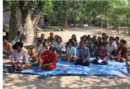
Training sessions on savings principles and,

The exposure visit is one of the most effective ways of CamFAD under support from Agriterra and farmers to farmers cooperation in the region, farmers got new ideas and realized much on associative functioning, added value of FO and knowledge received from all visited areas to consider when they came back to Cambodia. BoD have their regular meetings which they can discuss their problems, exchanged experiences, improved their roles and responsibility as a leader. Two staff have gained knowledge directly from