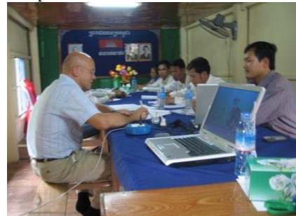
Consultant from Agriterra meeting with CamFAD staff after a strategic plan, Nov

Finally, there are 16 members based organizations from 85 villages in four provinces have registered as membership of CamFAD these are: 1. Svay Rieng: Svay-Chrum, Portireach, Thlork, Svay-Tayean, Thnot, Kampong-Chamlang x2 , Chek, Basac, Koy-Trabek, Kruos, Svay-Ang of three districts (Svay- Chrum, Svay Rieng and Kampong Ro) 2. Prey Veng: Speukor and Rongdomrey of one district (Baphnom) 3. Kampong Speu: Kanduoldom of one district (Chbarmorn) and 4.