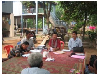
Workshop training at Thmey-Samakee community, Kampong Speu