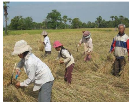
Harvesting activities of members

The elected leaders (chairman, vice chairman and cashier) from CFAs and CBOs receive a training on additional roles, responsibility, organizational management including estimate of small business, income and expense control, indication the