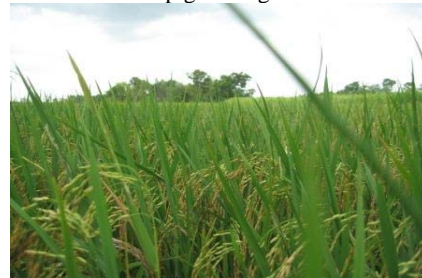
SRI practice in 2008