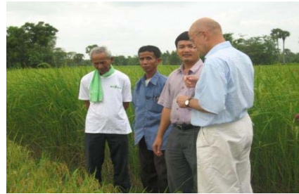
Consultant from Agriterria visited the SRI practice of members