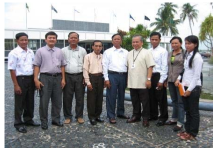
Group picture at IRI, Philippine