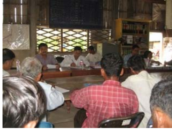
Workshop training at Samakum Apiwat Kumkrous CDA, Svay Rieng

Kandal: Samboo Meas commune, Mok Kampool district.