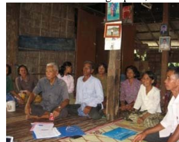
Workshop training with Agricultural Development Community (Sor.Or.Kor) Raksmev Samakee Association (RSA), Prey Veng

Finally, there are 16 members based organizations from 85 villages in four provinces have registered as membership of CamFAD these are: 1. Svay Rieng: Svay-Chrum, Portireach, Thlork, Svay-Tayean, Thnot, Kampong-Chamlang x2 , Chek, Basac, Koy-Trabek, Kruos, Svay-Ang of three districts (Svay- Chrum, Svay Rieng and Kampong Ro) 2. Prey Veng: Speukor and Rongdomrey of one district (Baphnom) 3. Kampong Speu: Kanduoldom of one district (Chbarmorn) and 4.