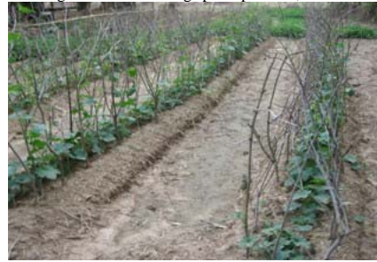
Green gourd trellis