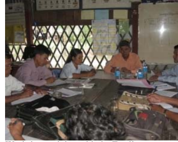
Workshop training with the Family Economic Development Association FEDA, Kampong Chamlang, Svay Rieng

These member organizations have also elected their leaders by democracy with regular mandate of office holding within the management committee. Up to now CamFAD has 818 different registered producer groups under these 16 members organizations which categorized into 1. savings, 2. animal rearing, 3. poulties rearing, 4. vegetable growing, 5. fish raising, 6. rice growing, 7. handicraft groups 8. rice bank, 9. cow bank 10. fertilizer credit and other involving business initiated by individual members.