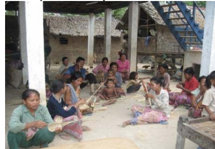
Activities of making bamboo products