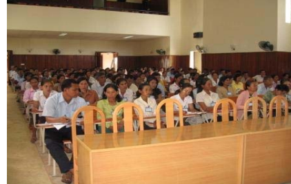
Annual general meeting last 30 th December, 2008 at Chné Tolé conference hall, Svay Rieng