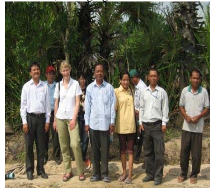
Picture during advisory mission of Agriterro to CamFAD