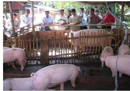
Farmers visited pig rearing activities