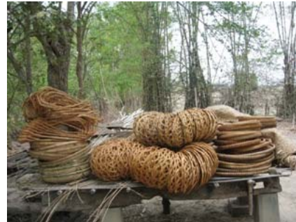
Bamboo products made by members

Knowledge and skills of pig rearing, chicken rearing, vegetable/crops growing, rice growing and agriculture production process have been trained to 560 new members which 336 female in Svay Ang, Kruos, and Kampong-Chamlang in Svay Rieng province, Speukor, Rongdomrey in Prey Veng and Kanduoldom communities in Kampong Speu province, the training sessions started from 8-22 September 2008. The 59 village women associations (VWAs) equal to 771 members as gender groups received technical training on handicraft skills, saving principles and proper cow/buffalo rearing courses which started from 21-31 October 2008, more further the women groups have also received diversification skills in bamboo handicraft and broom making activities, these groups have received clear training courses on proper producing, oriented principles process into proper quality, market access and knowledge on calculation of income, loss and expense for their small business involved toward long run in the future, these courses took almost three