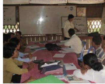
Workshop training with Integrated Development Association IDA, Svay Rieng